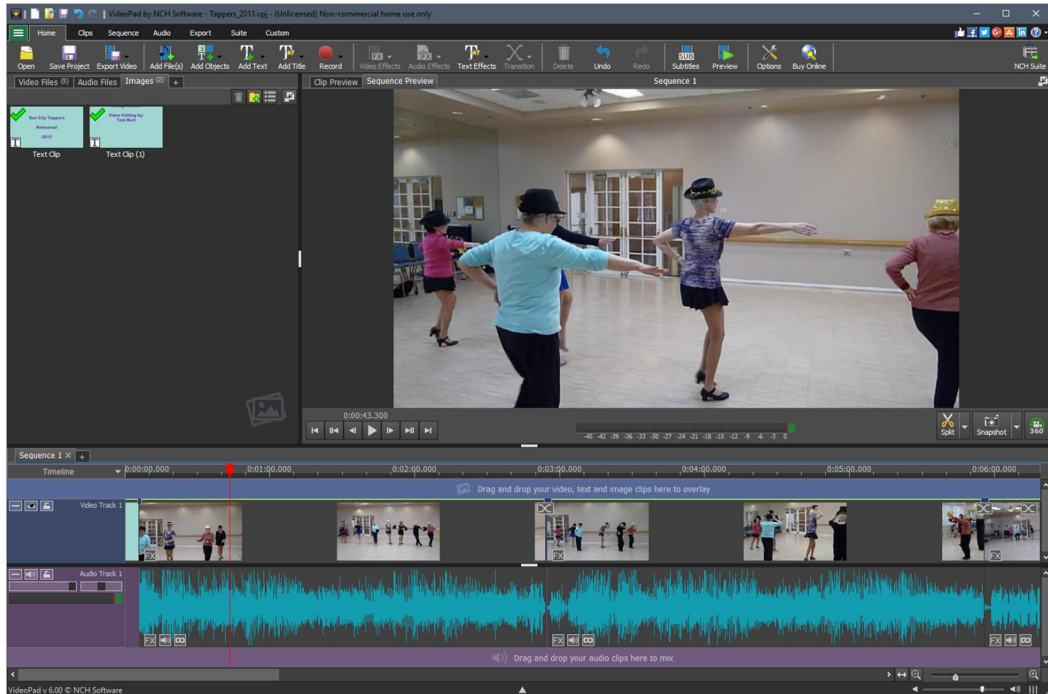
Video Editing With NCH VideoPad