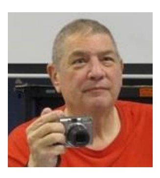
"Memories & Magic"

For Computer Club seminars, there is no requirement for advanced registration unless explicitly stated. Seating is first-come, first-seated.