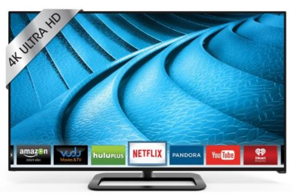
VIZIO P-Series 70" Class Ultra HD Full-Array LED Smart TV

An LCD display is a rectangular array of dots (pixels). Screens are characterized by the size and shape of this array. Older displays used a ratio of 4 pixels wide to 3 pixels high (4 by 3). New displays are more commonly in the ratio 16 pixels wide by 9 high – the standard for high definition TV. However, other ratios are used as well. A typical 24 inch display will be 1920 pixels wide by 1080 pixels high, giving 2,073,600 pixels in total. The latest "Ultra HD / 4K" HDTVs have doubled this resolution to 3840 pixels wide by 2160 pixels high, giving almost 8.3 million pixels in total.